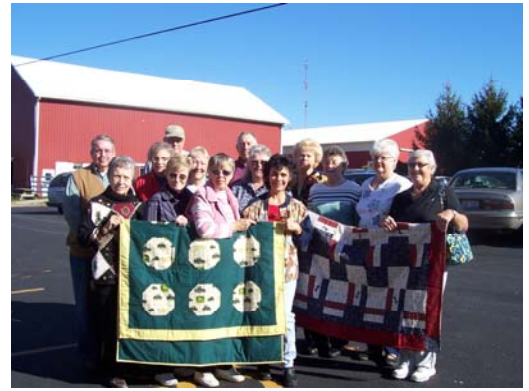
“Thank you”, Knotting Ladies for the lovely quilts and Palmyra Church of Christ Women’s Fellowship for the supplies they donated.

N 60 Vinyl Mattress Covers (Heavy duty, deep pocket, twin sized) Toilet Paper E Kleenex Deodorant (boys and girls) E Bath Soap (gentle) Canned Goods D Bath Towels Sheets S Laundry Detergent Cleaning Supplies Window Cleaner Scrubbing Bubbles L Dishwasher Detergent Dish Liquid I (2) Five-Shelf, Heavy Duty Metal Racks S Used, Sturdy Couches/Sofas Vinyl Couch T Washable Furniture Covers for Couches Large, Clear Storage Containers