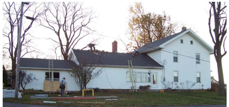
“Thank you” to CertainTeed and P & W Roofing Supply for making the roofing project on the farmhouse, where CCHO began in 1969, possible!